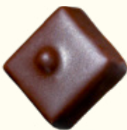
White Night Jasmine Tea, Dark Chocolate Ganache

Only available at TWG Tea Salons & Boutiques at MBS on the Bay and Takashimaya B2