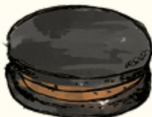
Napoleon Tea & Caramel