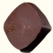
Vanilla Bourbon Tea, Dark Chocolate Apricot