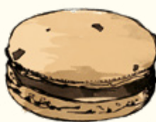
Number 12 Tea & Tiramisu