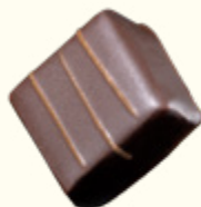
Napoleon Tea & Caramel