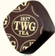
1837 Black Tea, Dark Chocolate Ganache