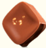
Miraculous Mandarin Tea, Sesame & Honey