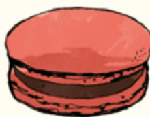
Bain de Roses Tea