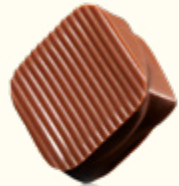
1837 Green Tea, Raspberry & Caramel