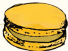
Lemon Bush Tea