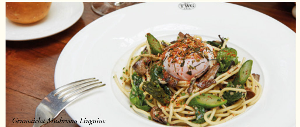
Genmaicha Mushroom Linguine

Toasted artisanal English muffins topped with two poached free-range eggs accompanied by a petite mesclun salad tossed in an 1837 Green Tea infused vinaigrette and a choice of beef pastrami, smoked salmon or guacamole with feta cheese, served with a choice of orange and saffron hollandaise sauce or béarnaise sauce.