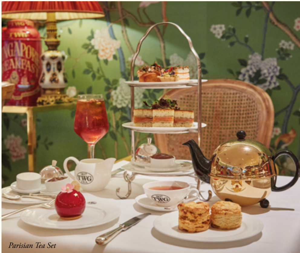
Parisian Tea Set