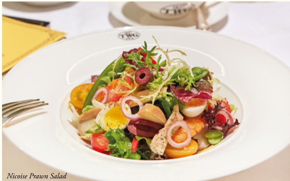
Nicoise Prawn Salad