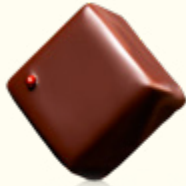
Singapore Breakfast Tea & Hazelnut