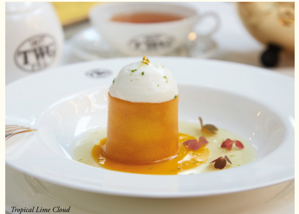
Tropical Lime Cloud

Please ask your waiter for this week's special creation. Only available on weekdays.