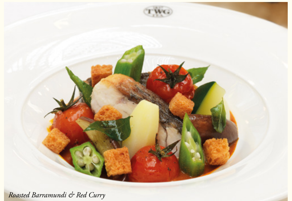
Roasted Barramundi & Red Curry