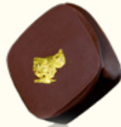
Earl Grey Fortune, Dark Chocolate Ganache