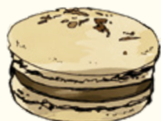
Vanilla Bourbon Tea & Blackcurrant