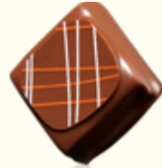
Polo Club Tea, Chestnut & Apricot