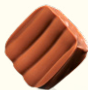
African Ball Tea, Peanut & Salted Caramel