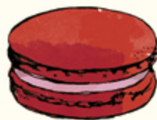
Silver Moon Tea & Strawberry