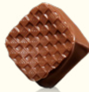
Brothers Club Tea, Maple Syrup & Pecan