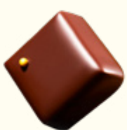
Grand Wedding Tea & Passion Fruit