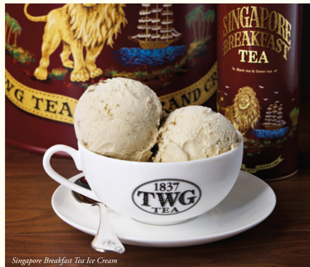
Singapore Breakfast Tea Ice Cream

TWG Prices are not inclusive of service charge or goods & services tax. Minimum order of one teapot per person. PLEASE ASK YOUR WAITER ABOUT ALLERGENS.