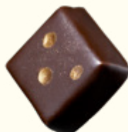
Matcha Nara, White Chocolate Ganache