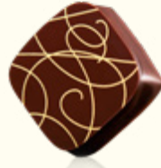
Lemon Bush Tea, White Chocolate Ganache