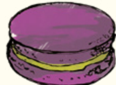
Grand Wedding Tea, Passion Fruit & Coconut