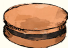
Earl Grey Fortune & Chocolate