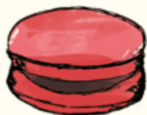
1837 Black Tea & Blackcurrant